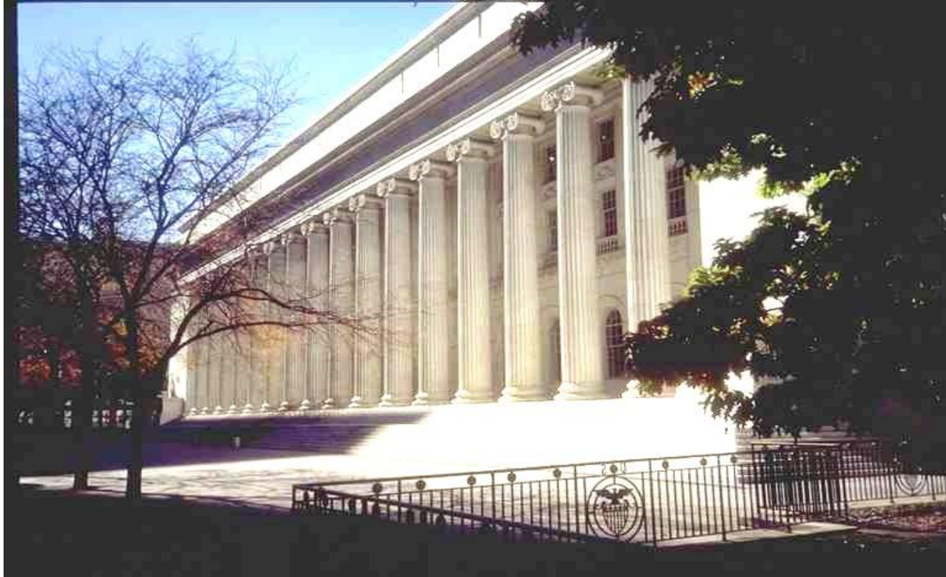
Byron R. White U.S. Courthouse