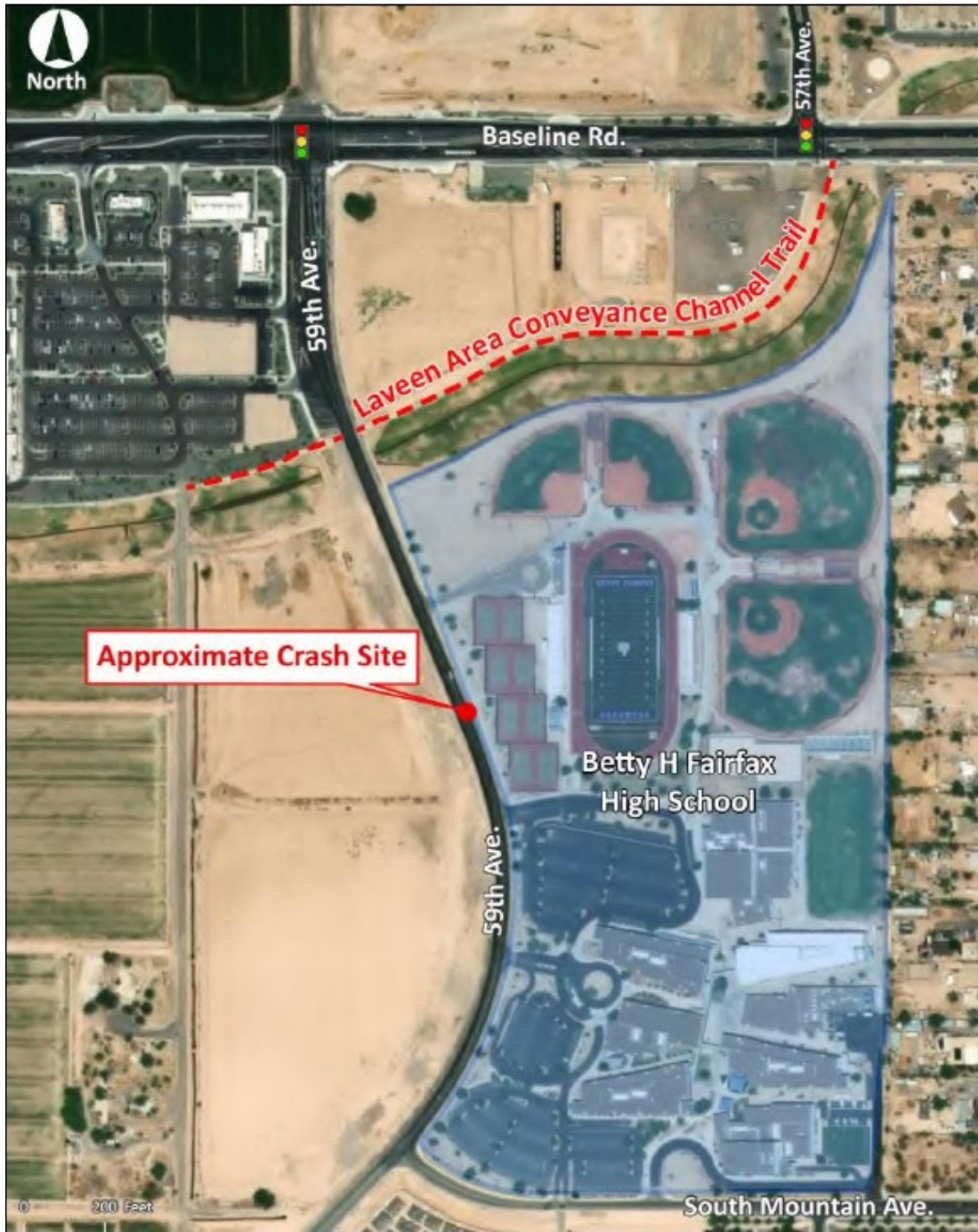
Figure 1: Approximate Crash Location and Vicinity